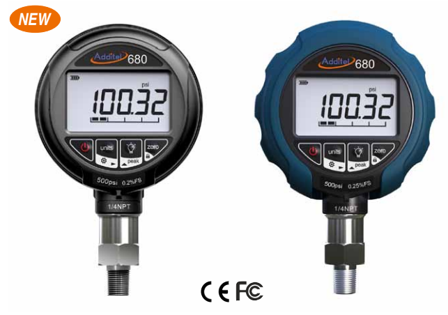
680 pressure gauge