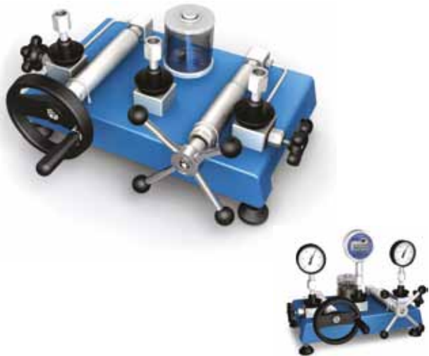
-12.5 psi to 37,500 psi